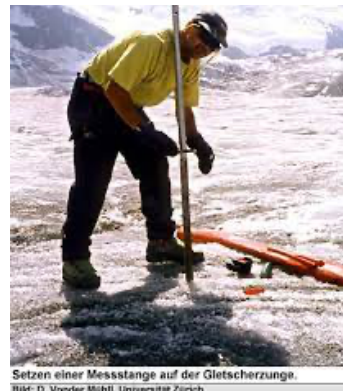
Setzen einer Messstange auf der Gletscherzunge.

The water equivalent indicates the water content of the measured thickness changes in the ice. One metre of ice corresponds to about 0.9 metres of water equivalent.